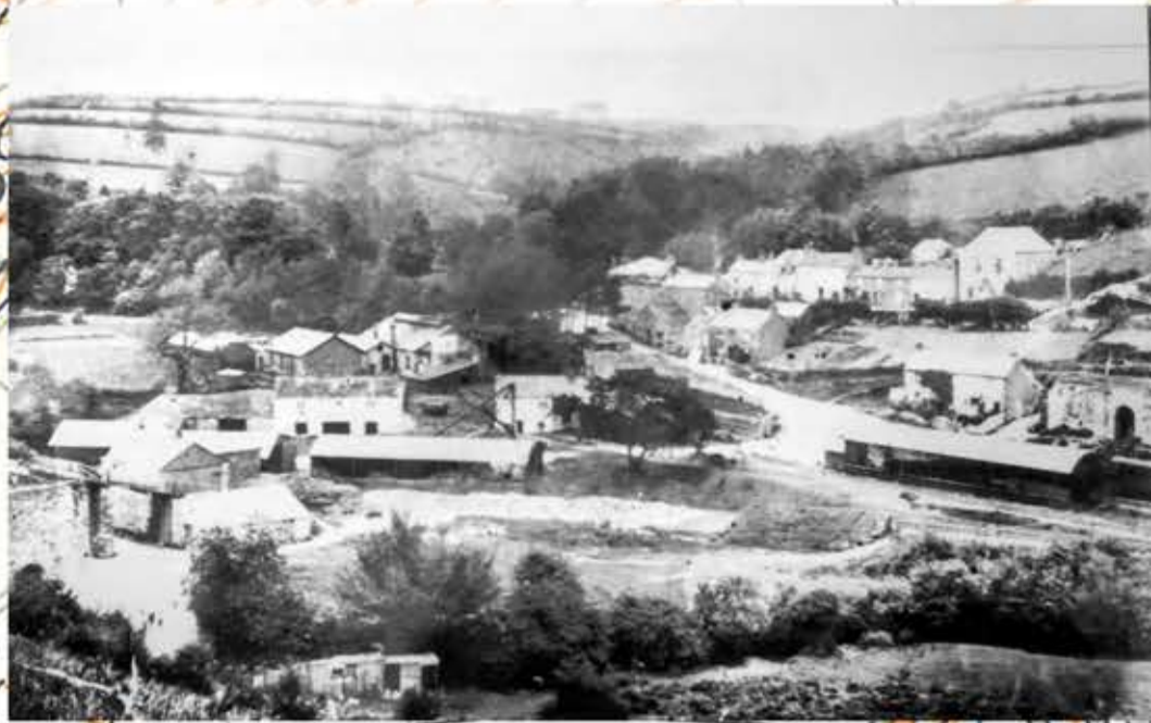
This amazing photograph taken from the southwest shows Moorswater village looking down, upon what was then, a hubbub of industrial buildings and infrastructure. Centre middle are the railway sheds and far left Hodge's Kiln with its inclined plane, below which the former canal basin is full of what appears to be limestone.

Liskeard & Caradon Railway Bed - Since 2006 a designated section of the Cornwall and West Devon Mining Bed World Heritage Site. The line north to the mines and quarries closed in the early C20th but much of its bed can still be traced. Search out the "Caradon Trail" for more information on following it.